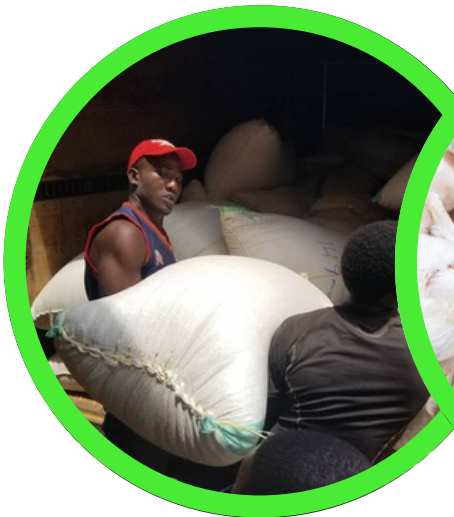
Maize grain trade